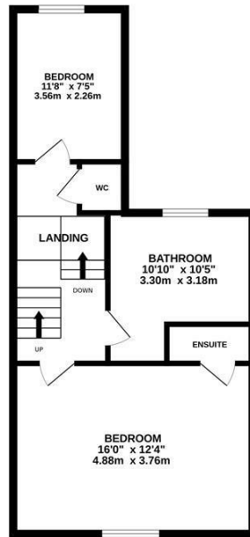
2ND FLOOR 398 sq.ft. (37.0 sq.m.) approx.